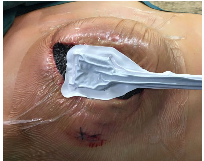
FIGURE 3 Foam dressing in the wound covered by the adhesive film and the suction port applied

GM can present a clinical dilemma from diagnostic and therapeutic perspectives. There is increasing evidence of an association between Corynebacteria and a distinct pattern termed cystic neutrophilic GM. 2-4 When none of the known etiologies can be proven, the