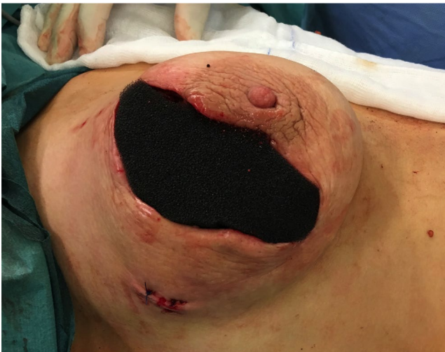
FIGURE 2 Right breast after the excision of the granulomatous tissue, and the cavity containing the tailored foam dressing of the NPWT kit

we completed the NPWT and a secondary closure of the wound was performed. The patient was cured 6 months after first presentation. The initially seemingly intractable disease necessitated a large incision and cavity with the addition of NPWT to evacuate the purulent exudate; consequently, the scar was also large and resulted in no excellent but moderate-to-good cosmetic result (Figure 4). The patient was satisfied with this and declined any second step correction.